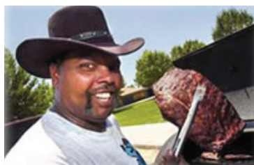
Rodeo Daddy's BBQ

Did you know authentic BBQ takes over 18 hours to prepare? Your nose knows and it will lead you to Blues, Brews & BBQ to enjoy the labor of love that is the "real deal" BBQ. Our vendors will be serving up heaping plates of the delectable delights, including every moo, oink, cluck, and swimmer that will take on smoke and sauce for a price that won't break the bank!