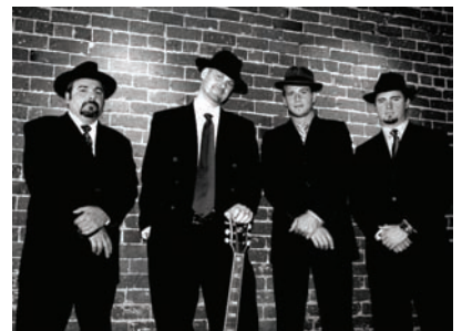
Big Papa & The TCB